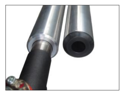
Ø25mm and Ø17mm spindle